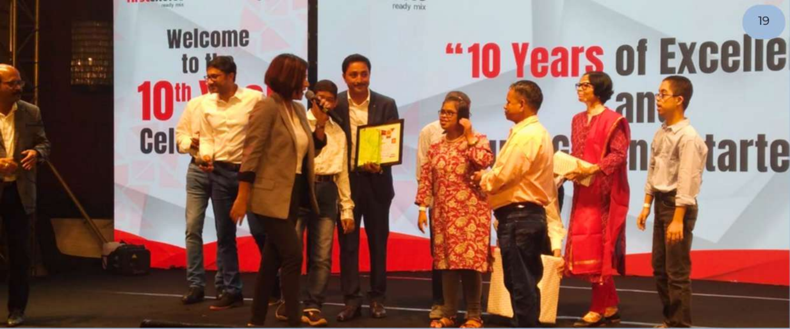
Participation in an inclusive & interactive visit by corporate organisation M/s First Choice Ready Mix for their 10th year celebration, they also provide regular CSR support.