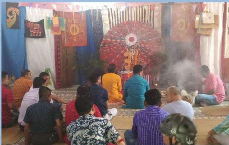
Community Celebrations for Vishwakarma Puja at the Workshop: Members are in a festive mood as we fondly worship the God of creativity, skill, and craftsmanship.